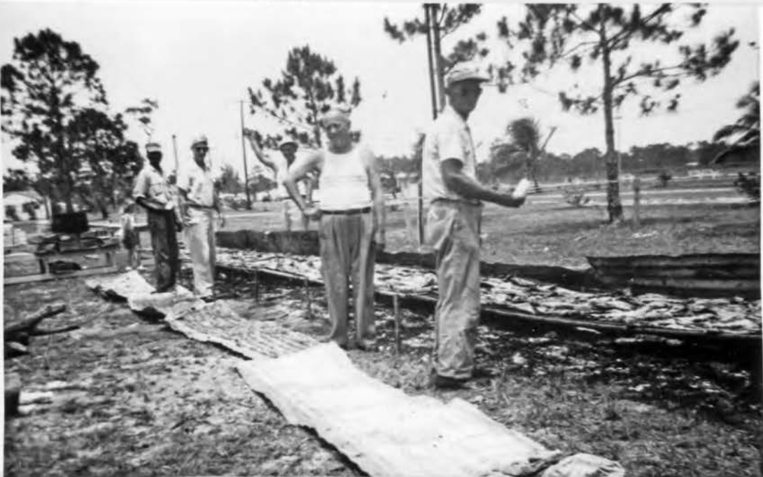
Wilton Manors, Bar-B-Que