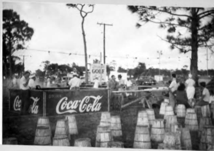
vegetable bushel baskets used for seating