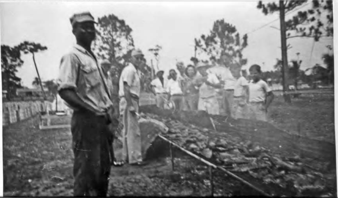
labeled "Leaver" -center