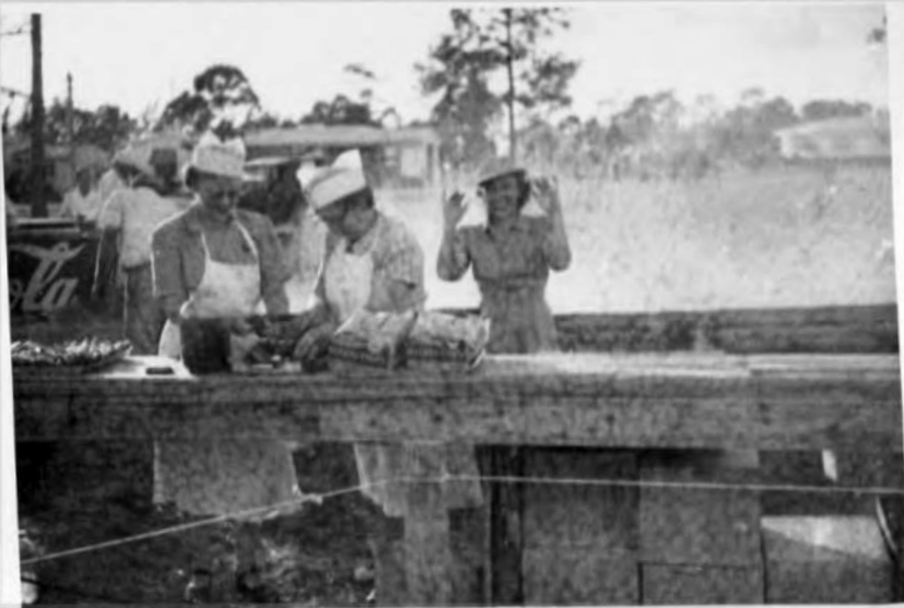
center is Lou Lever