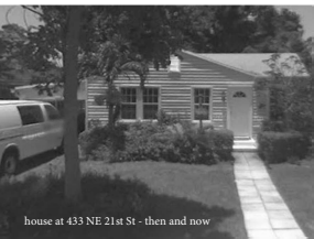
house at 433 NE 21st St - then and now