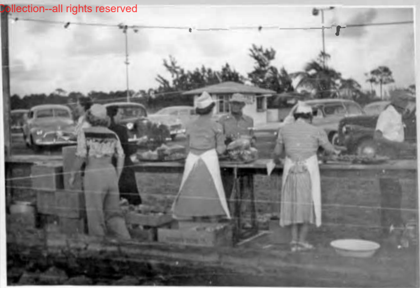
background is Tropical Golf Driving Range-roughly site of current City Hall