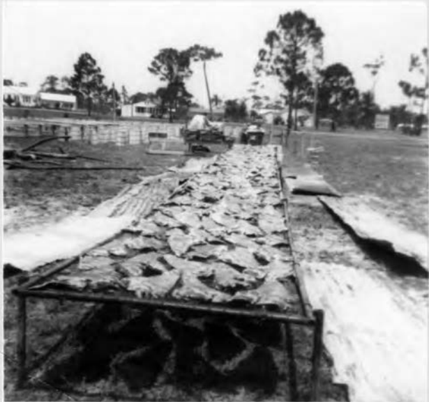
note number of bushel basket seatsupper left