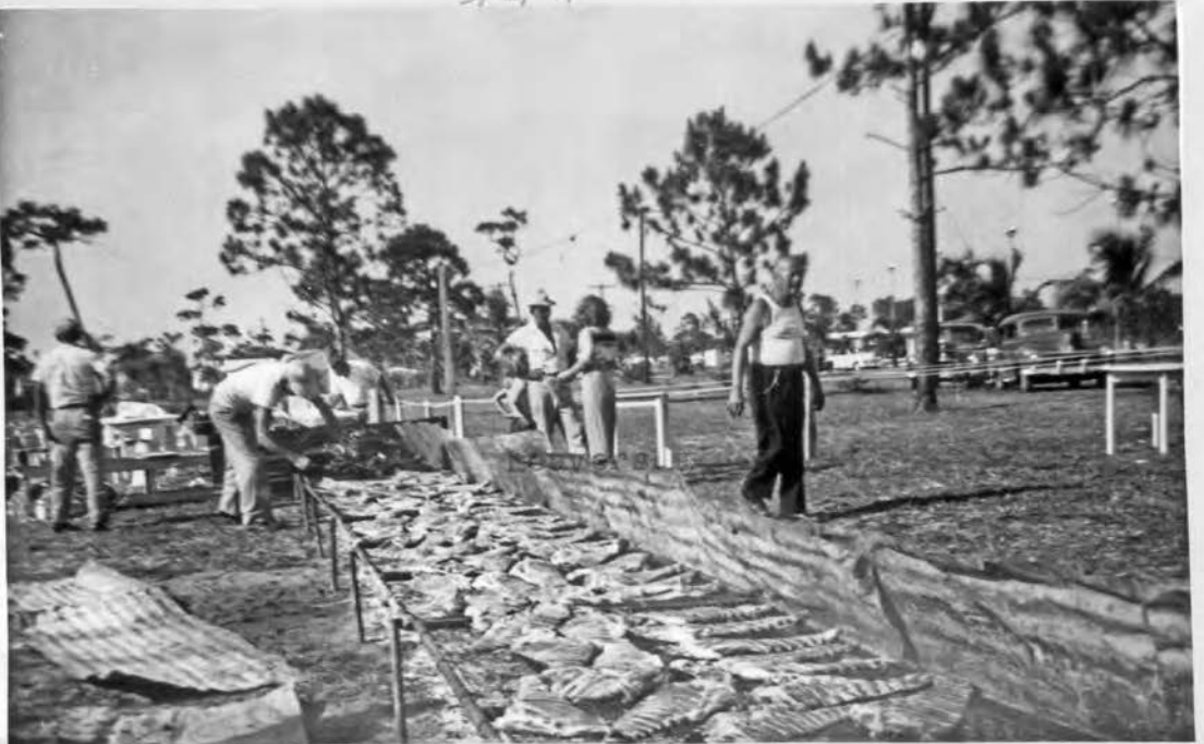
Wilton Manors, Bar-B-Que