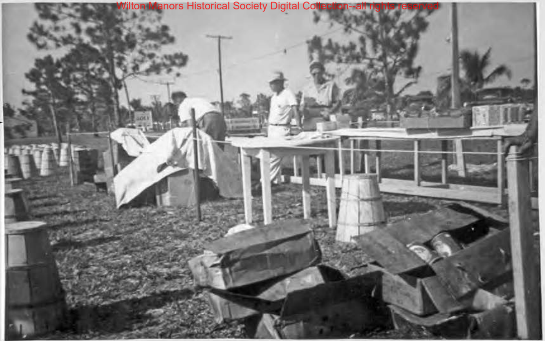
Wilton Manors, Bar-B-Que