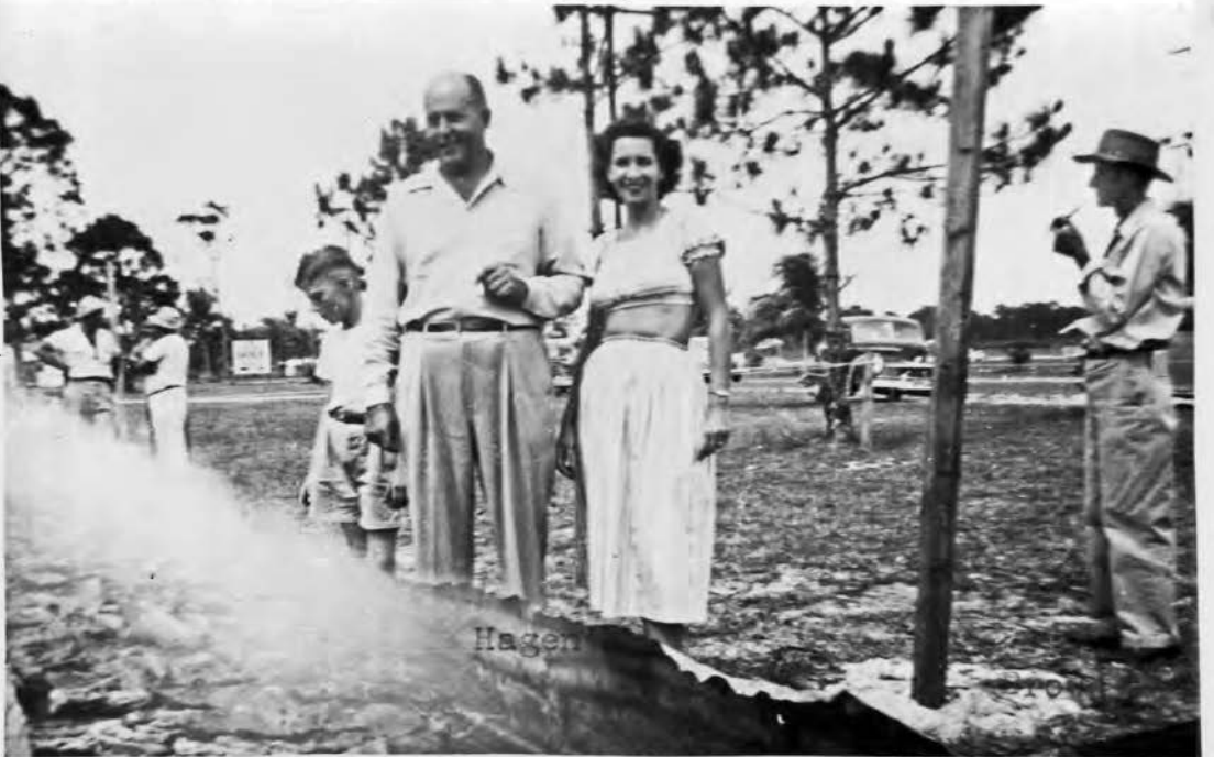
Wilton Manors Bar-B-Que