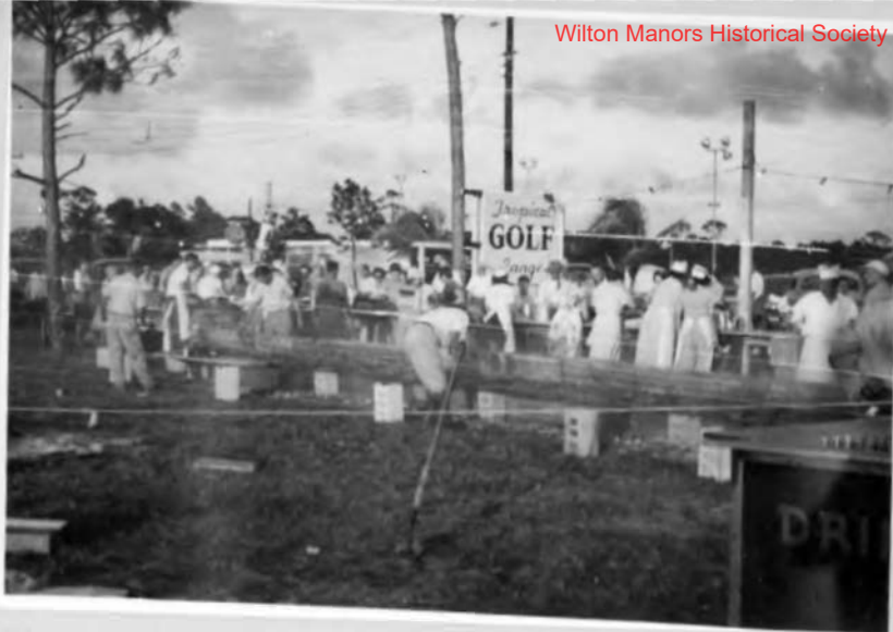
note Gulf gas station sign-left center