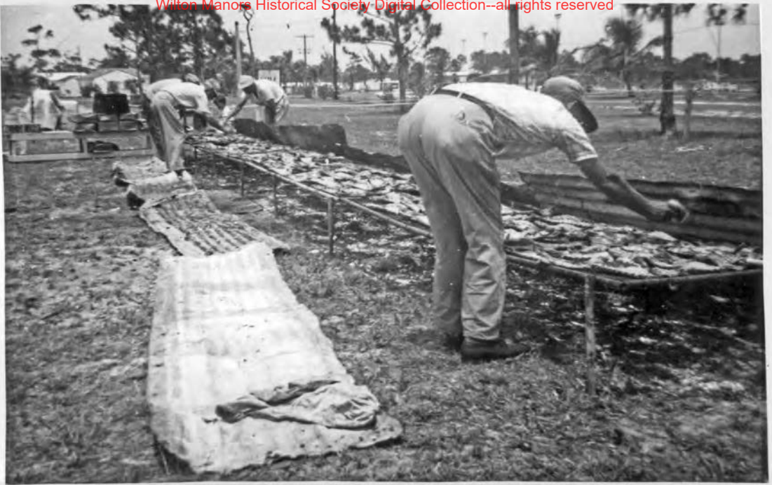
Wilton Manors, Bar-B-Que