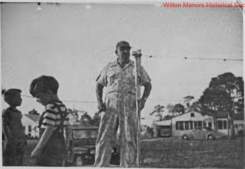
house in background is 433 NE 21 STREET