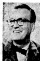
DAVE GARROWAY ... missed