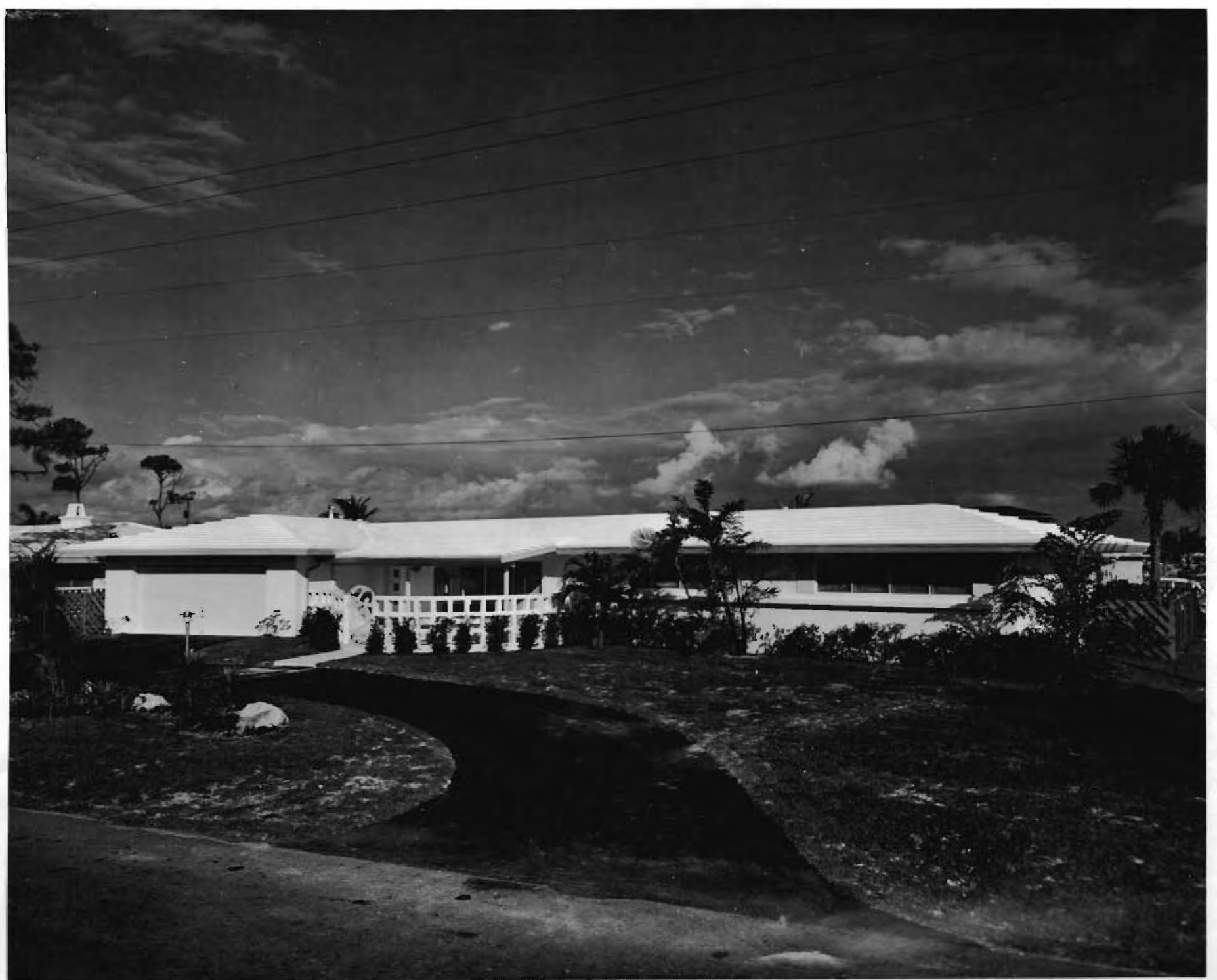
Wolff Photo. Fort Lauderdale, Florida