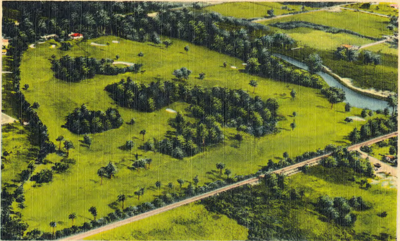
Richardson Golf Course, NE 4th Ave., Fort Lauderdale, Florida.