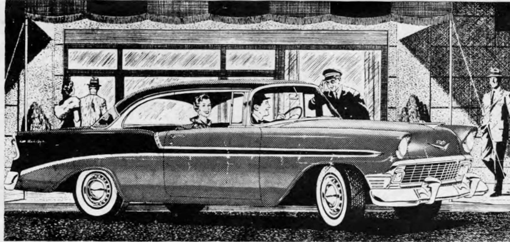
THE NEW BEL AIR SPORT COUPE

a simple deduction so you won't check out in the RED!