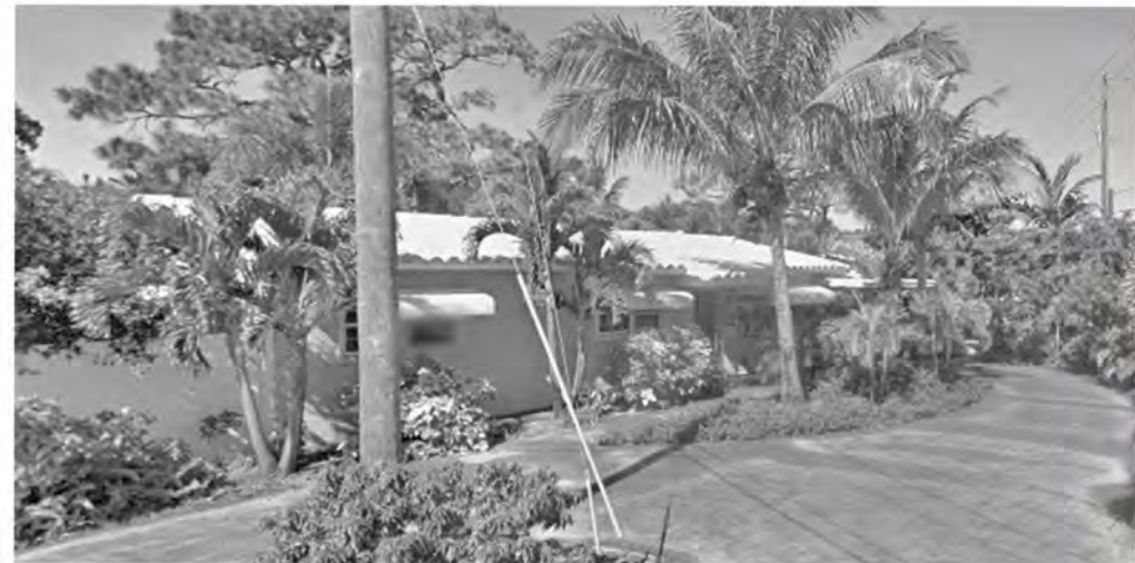
1953 Wilton-Oakland Sun