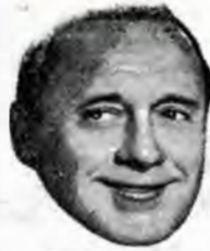
Says JACK BENNY CBS-TV's Sunday Star

All written content and individual images are ©Wilton Manors Historical Society. Any duplication, publication or other re-use requires permission and appropriate attribution.