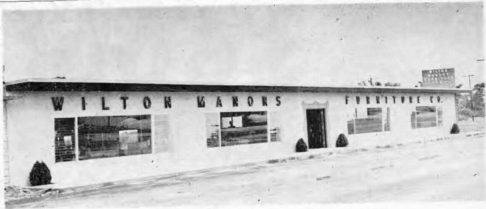
NEW WILTON MANORS FURNITURE BUILDING

Elfers and Osinga bought the company out only last April, and immediately started plans for expansion and their new building at 2097 Wilton Drive.