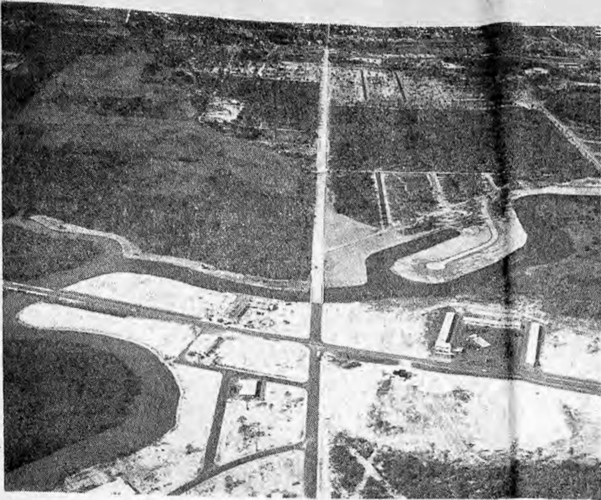
Aerial photo above shows new link between Wilton Manors and Federal Highway, to be dedicated Sunday afternoon at 3 o'clock with Rep. Dwight L. Rogers heading list of dignitaries. Photo, looking westward, shows Coral Ridge in lower foreground, Federal highway, new bridge across Middle River just below center, Galt Boulevard extending on westward through new developments Coral Point, Coral Gardens, Middle River Estates. Wilton Manors proper, growing steadily toward Federal highway, may be seen in background at top.

Season's Greetings to Our Friends and Customers