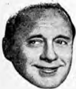
Says JACK BENNY CBS-TV's Sunday Star

I'M TRADING IN MY MAXWELL FOR A NEW CBS-COLUMBIA TV SET