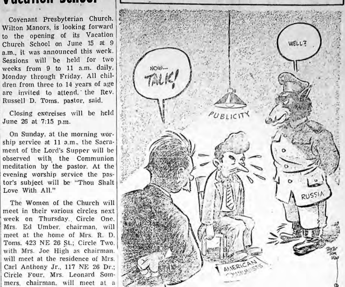
On The Svot