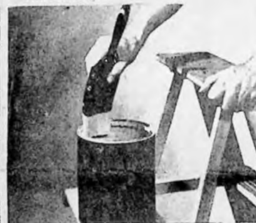
Lightly wipe off excess paint against side of can.