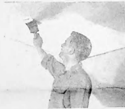
Start with the ceiling and paint across the narrow dimensions.