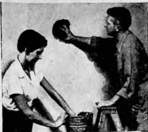
Wash walls thoroughly to remove all dust and grease.