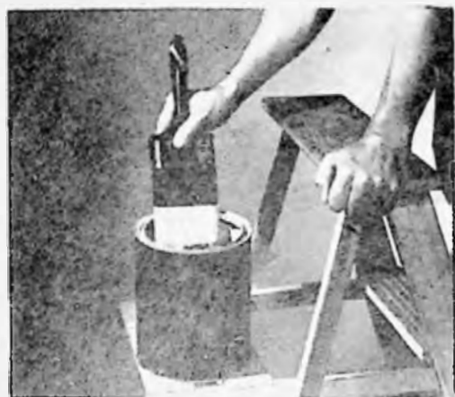
Dip brush about half the length of the bristles.