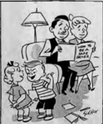
"It's their homework - S-D Day is coming up December 1st!"