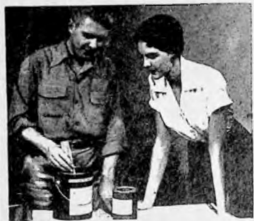
Stir paint thoroughly until contents have smooth, even consistency.