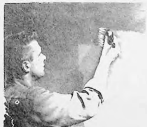
Keep painting strips on wall narrow so you are always working with wet edge.

Tropical PAINT Supply 2183 WILTON DR. (OR N. E. 4th AVE.)