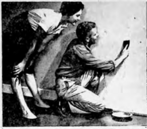
Patch all cracks and holes in a plaster wall before starting to paint.