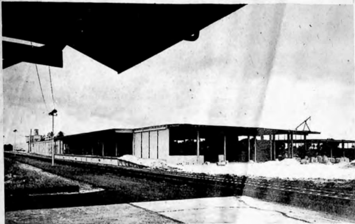
LOOKING TO THE FUTURE, POSTAL AUTHORITIES PLANNED SEMINOLE BRANCH STATION, WEST BROWARD BLVD. & SEABOARD RR., PLUNTY BIG. OVERHANG SHOWING IN PHOTO IS ROOF OF SEABOARD RR. STATION.