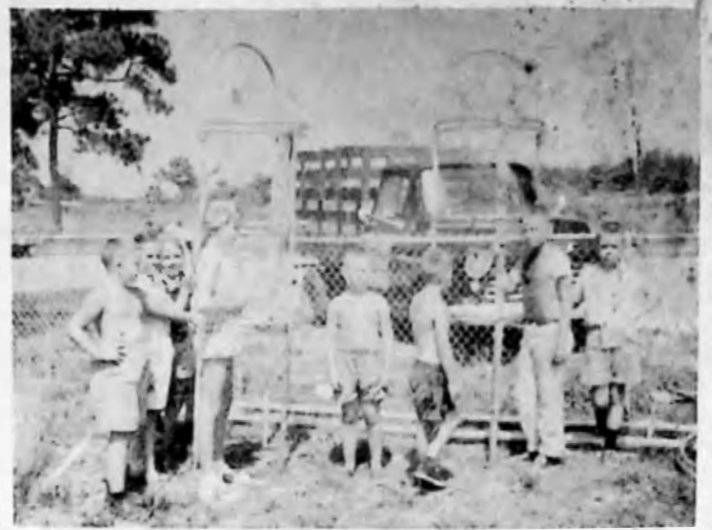
NEW PLAYGROUND EQUIPMENT JUST UNLOADED IS BEING CLOSELY INSPECTED BY SMALL FRY OF WILTON MANORS AT HAGEN PARK PLAYGROUND, WHICH WAS RECENTLY CONSTRUCTED THROUGH THE COMBINED EFFORTS OF LOCAL SERVICE CLUBS. THE FORT LAUDERDALE CIVITAN CLUB DONATED THE EQUIPMENT.