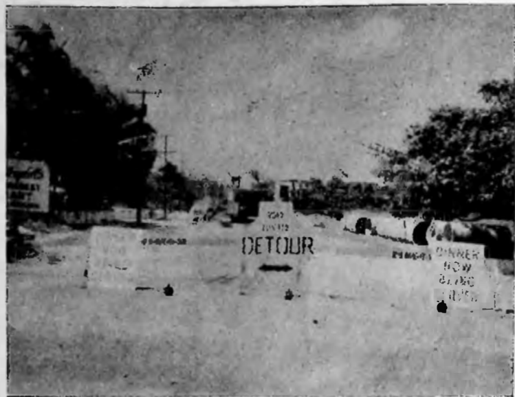
DETOUR SIGN LEAVES MOTORIST ENROUTE TO WILTON MANORS CONFUSED

Placed on N. E. 4th Ave., the site of installation of surface drainage sewers, the Detour Sign fails to direct Wilton Manors traffic on how to get there. There are no other directional signs after one takes a choice of direction to go (Sign indicates to detour East or West). Best Route into Wilton Manors Business Center is to turn left to Andrews Ave., then right on Andrews to the north end of Richardson's Golf Course (N. E. 21st Ct.) - turn right to Business Section.