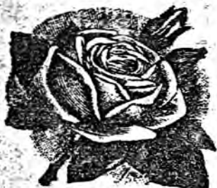
The Land of Flowers

Containing a General Alphabetical Directory, a Classified Business Directory, a Householder's or Street Directory, and Much Useful Information Classified as Miscellaneous—Including a Number of Towns and Villages in Broward and Palm Beach Counties.